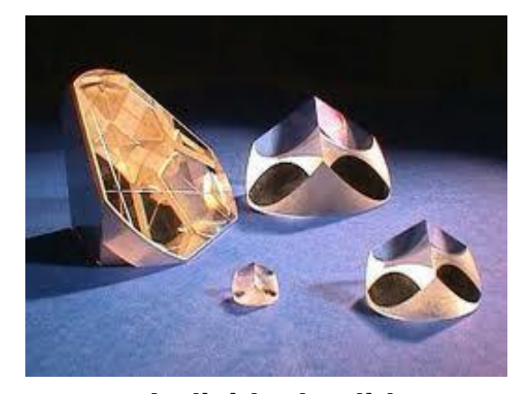
Individual solid corner cubes