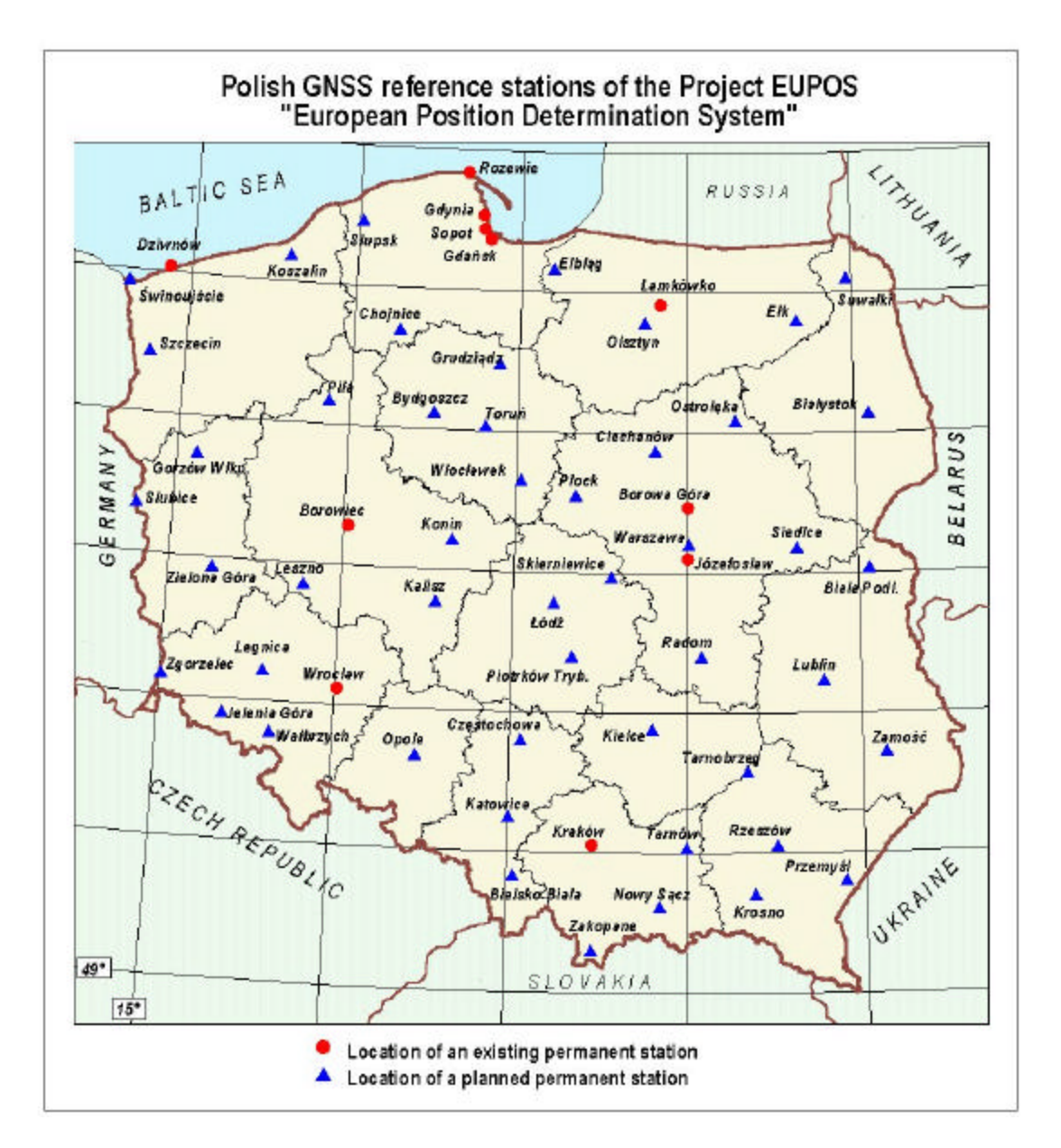
Fig. 2. Location of the GNSS stations of the Polish part of EUPOS network