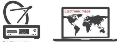
Satellite receivers and manufacturing