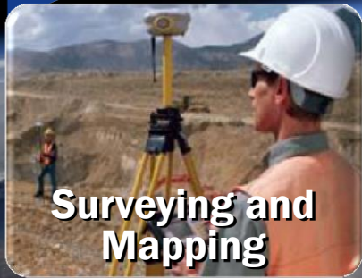
Surveying and Mapping