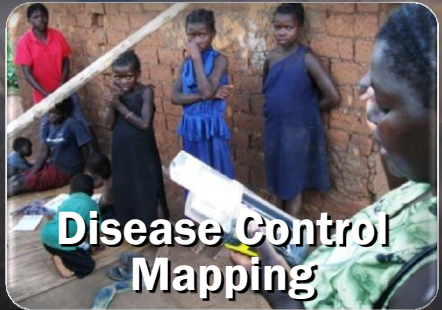
Disease Control Mapping