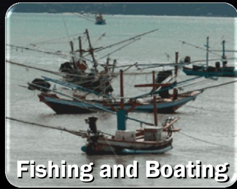
Fishing and Boating