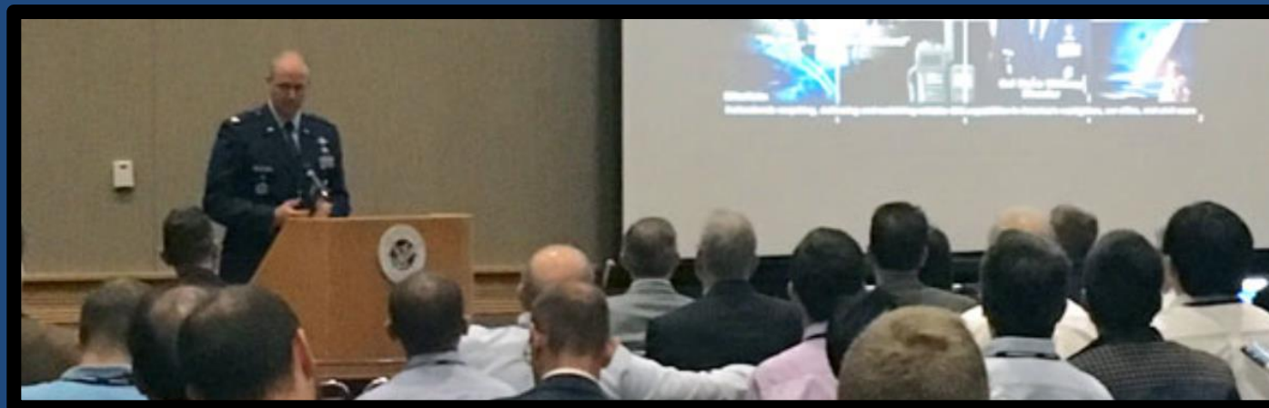
Image from the 56 th CGSIC Portland, OR 2016

At the Institute of Navigation GNSS+ 2017 Conference Oregon Convention Center Portland, Oregon September 25-26, 2017