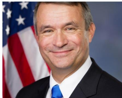
Rep. Don Bacon (R-NE)