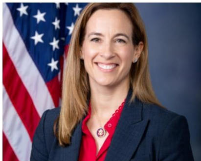
Rep. Mikie Sherrill (D-NJ)

Featured Remarks House GPS Caucus Co-Chairs: